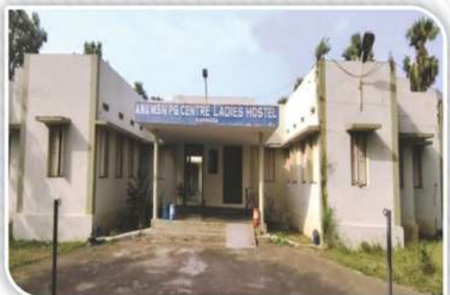
AKNU MSN Ladies Hostel, KKD Campus