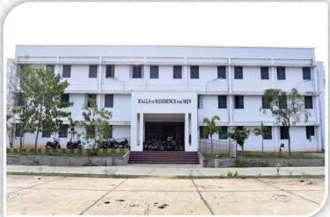
Halls of Residence for Men, RJK Campus