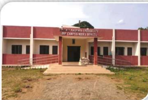
AKNU MSN Men's Hostel, KKD Campus