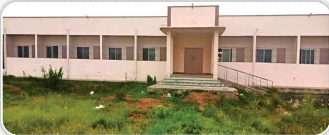
AKNU Hostel, TPG Campus