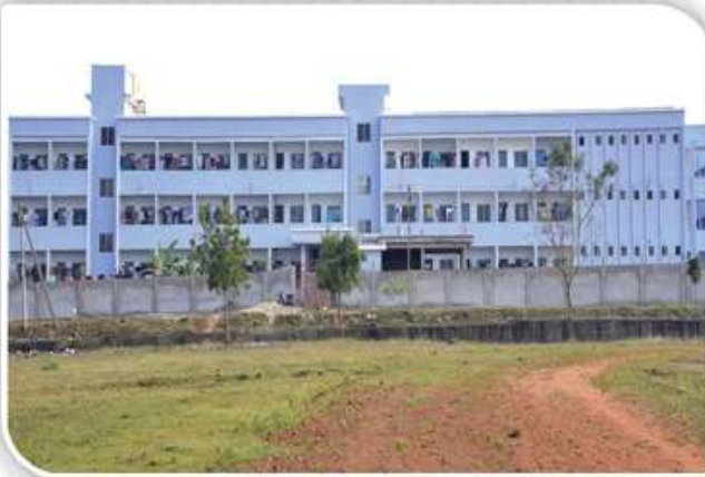
Halls of Residence for Women, RJK Campus